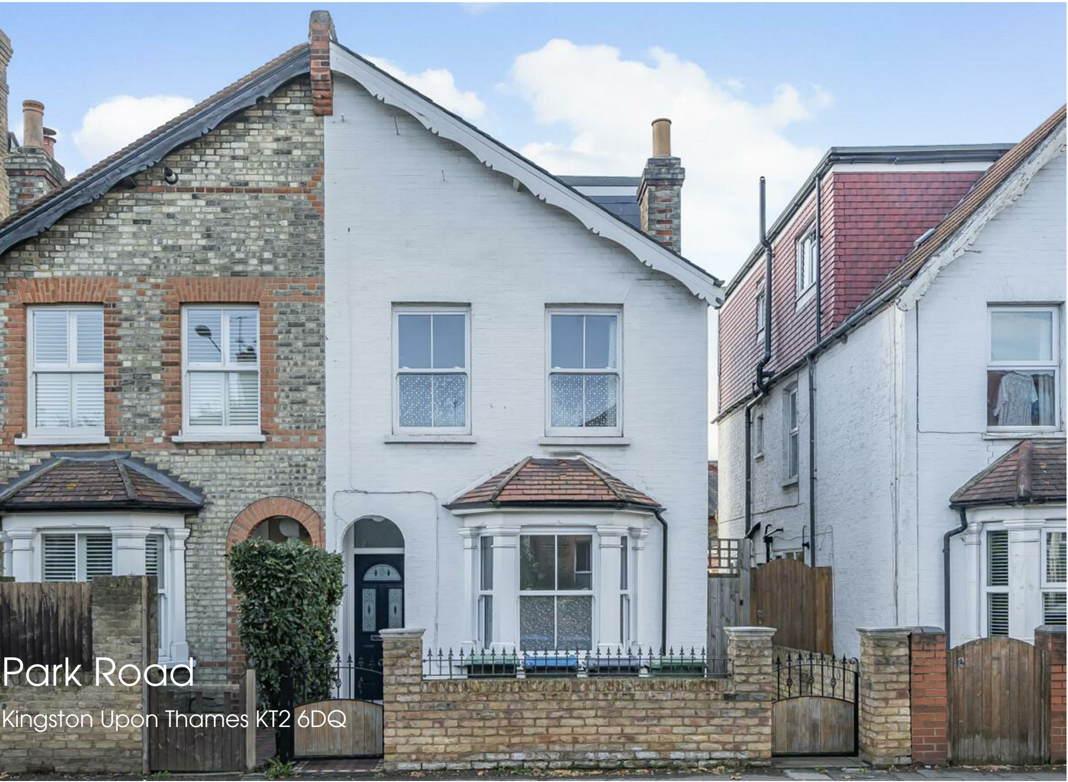
Park Road Kingston Upon Thames KT2 6DQ